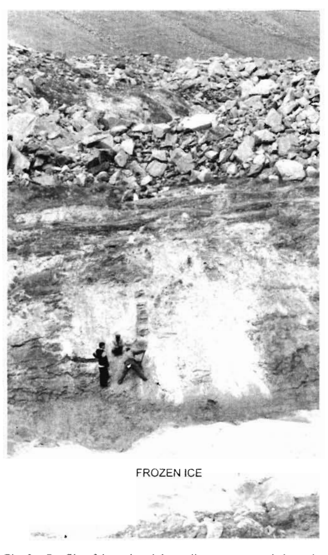
Fig. 2—Profile of the palaeolake sediments exposed along the right bank of Naradu Garang.

The entire thickness of the periglacial lacustrine sediment, exposed at the site, is nearly 4 to 5 m, but the palynological study is based on the analyses of samples collected from the finer fraction, which is barely